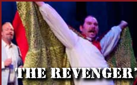
THE REVENGER'S TRAGEDY - 2011