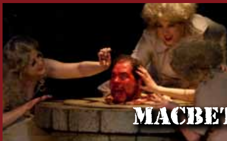
MACBETH - 2010