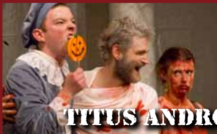
TTITUS ANDRONICUS - 2009

A gory revenge tragedy in the true spirit of GreenStage's popular Hard Bard series, Cardenio will take to the stage this Halloween. While scholars continue to debate whether it is the work of Shakespeare (and John Fletcher) or Thomas Middleton, one thing is certain: a bloodbath. Join us this fall for lust, ambition, intrigue, bizarre violence, and vicious satire.