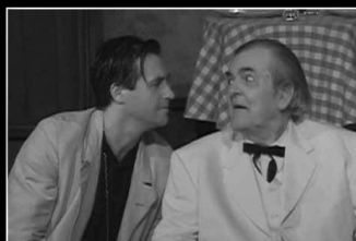
The Night of the Iguana - 2003