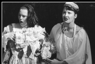
Taming of the Shrew - 2002