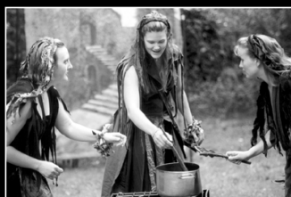
Macbeth - 2001