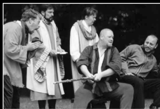
Henry IV, Part 2 - 2002