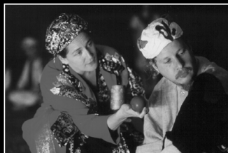
Timon of Athens - 1999